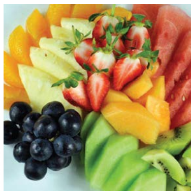
88. Seasonal Fruit Platter BDT 475.00 ++