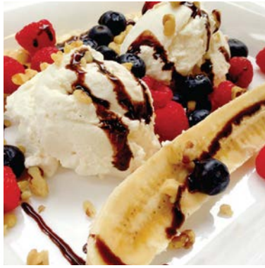
86. Banana Split BDT 450.00 ++