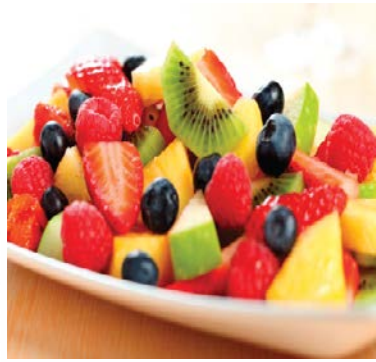
87. Seasonal Fruit Cocktail BDT 375.00 ++