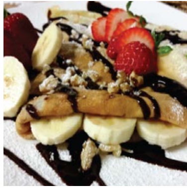
85. Crepes BDT 450.00 ++